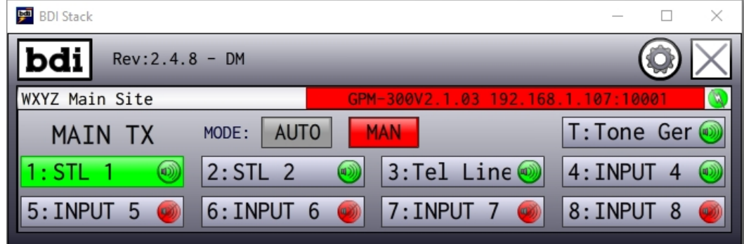
BDI Stack Graphical User Interface