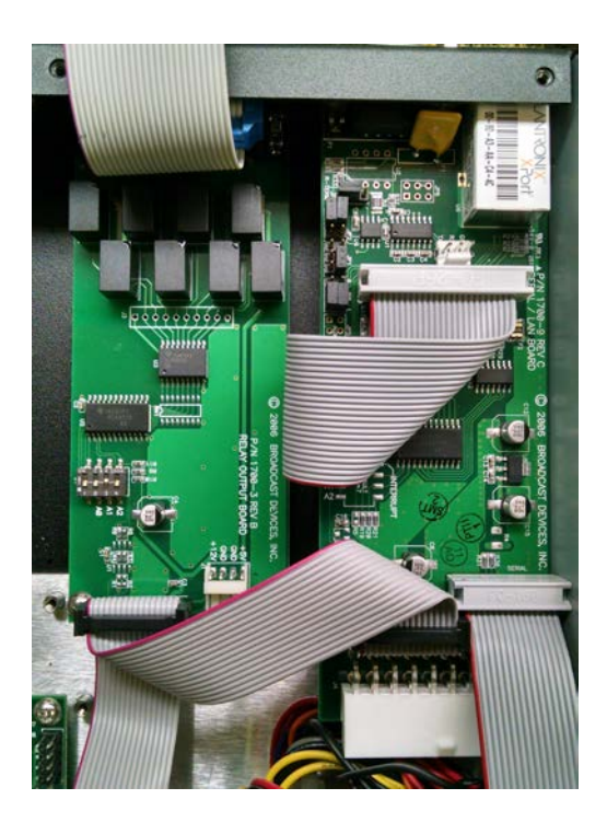
Fig. 1 Audio Alarm Status Board Installation