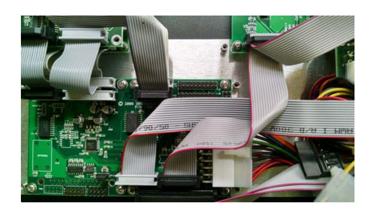
Fig. 2 16 Position Header Connection to DSP board