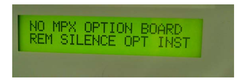
Fig. 3 Boot up Display message for a properly installed Alarm Status Board